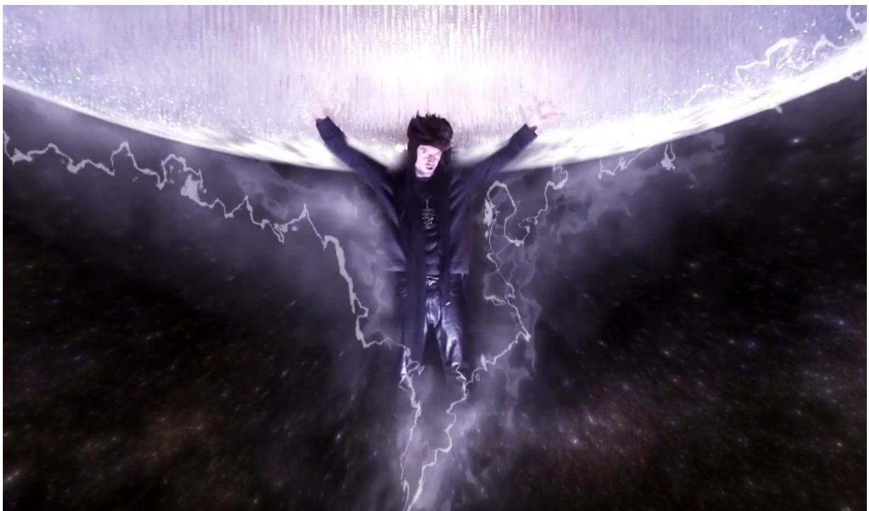
Still from the award-winning Virtual Reality video 'Playdough.' Click image to view.