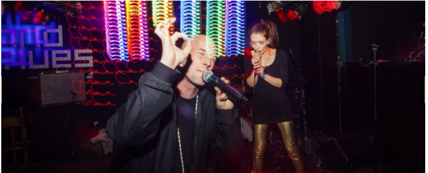
Iceland Airwaves performance in Conde Nast's W magazine. Click image to view.